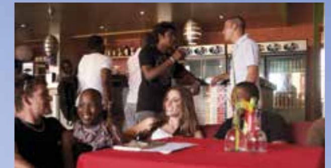
Studying abroad is a great way to make friends and build international networks.

In a 2012 study published in The New York Times , Monash University is regarded by global CEOs and chairmen the best university in Australia from which to recruit graduates.