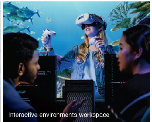
Interactive environments workspace