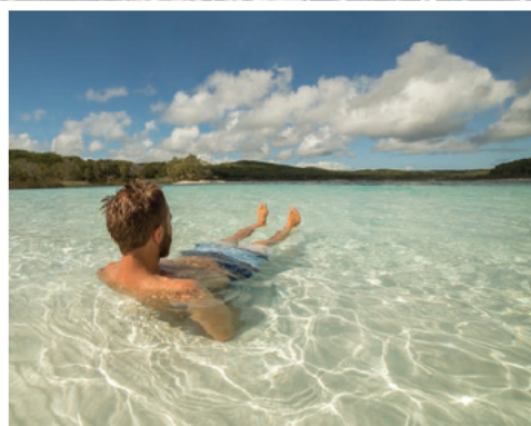
Visit world heritage-listed K'gari (Fraser Island), the world's largest sand island