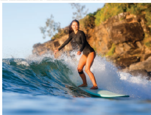
Discover Queensland's iconic Gold Coast and Sunshine coast beaches