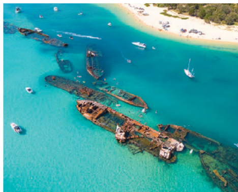
Escape to Mulgumpin (Moreton Island) or Minjerribah (North Stradbroke Island) for the weekend with your mates