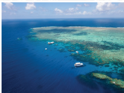
Snorkel on the Great Barrier Reef, a world heritage-listed natural wonder