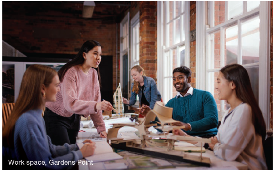
Work space, Gardens Point