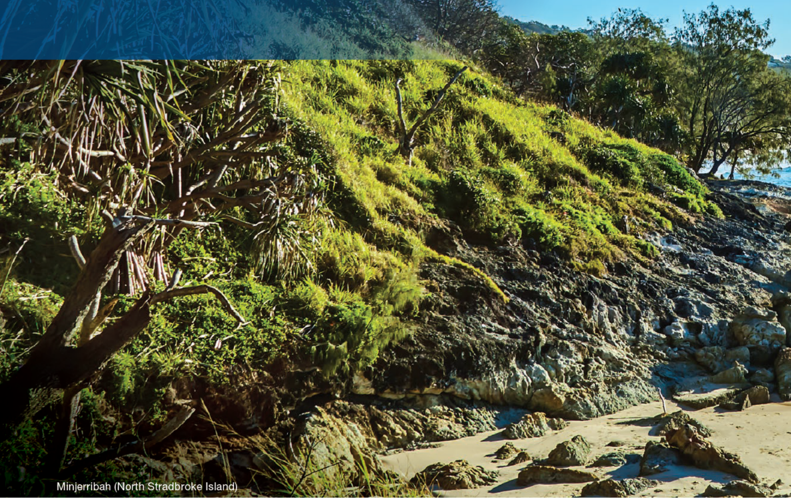
Minjerribah (North Stradbroke Island)

as World Heritage rainforests, pristine beaches, charming islands and unique wildlife.