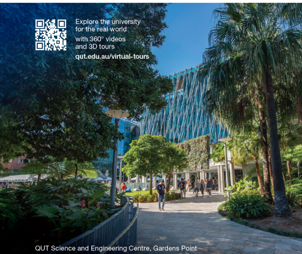
QUT Science and Engineering Centre, Gardens Point

Explore the university for the real world with 360° videos and 3D tours qut.edu.au/virtual-tours