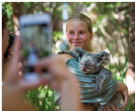
Cuddle a koala at Lone Pine Koala Sanctuary or Australia Zoo