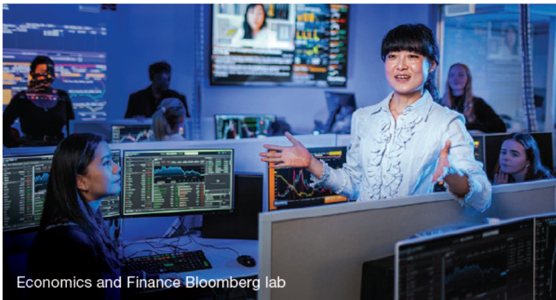
Economics and Finance Bloomberg lab