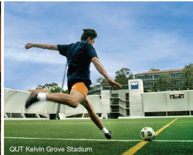
QUT Kelvin Grove Stadium