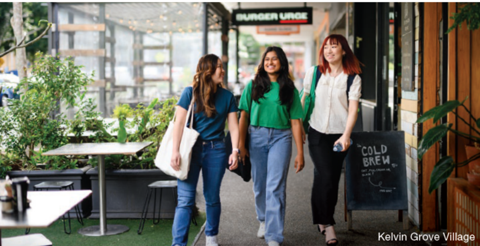
Kelvin Grove Village