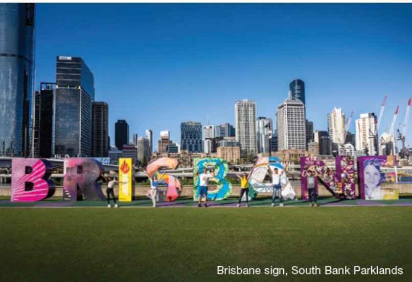
Brisbane sign, South Bank Parklands