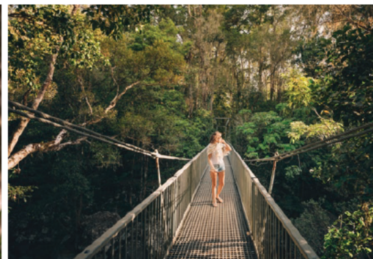
Explore Daintree National Park, the world's oldest tropical rainforest