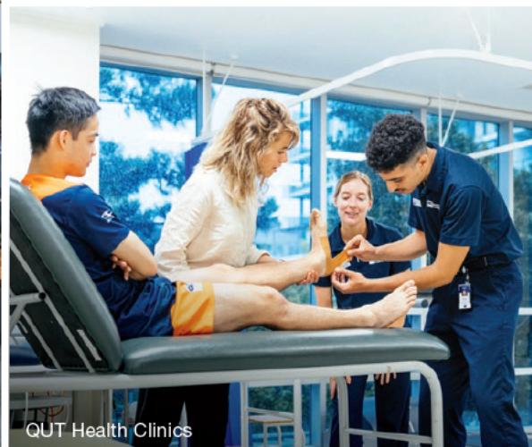
QUT Health Clinics