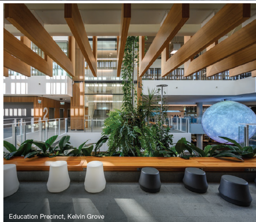
Education Precinct, Kelvin Grove